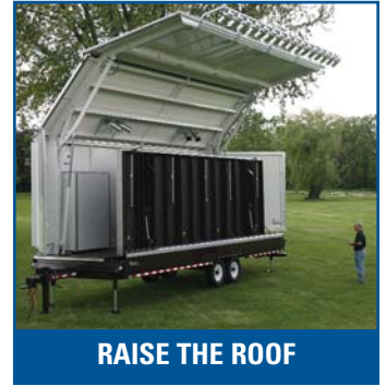
RAISE THE ROOF

Deploy the hydraulic roof/canopy and stage via wired remote control. Outside power isn't needed. You can lock the control for security or remove it altogether.