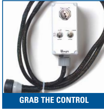
GRAB THE CONTROL

The entire panel on each end opens for easy access into the Showmobile and then becomes an adjustable side-stage sound reflector. The stainless steel door handles have integral locks so you don't have to worry about loose padlocks.