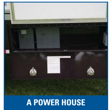
A POWER HOUSE

The storage compartments provide space for auxiliary equipment like power cords, staging accessories, skirting, sound equipment and other necessities. Access is easy and the compartments are lockable.