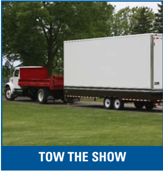
TOW THE SHOW

Showmobile's lightweight design allows access to more locations. When you reach the event location, it's easy to unhitch and drive the truck away.