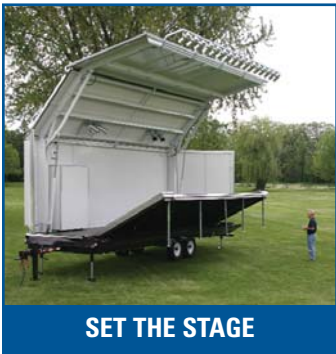
SET THE STAGE

Hydraulics raise the roof and canopy fast and smoothly - it only takes about 60 seconds. The high pivot point provides greater on-stage volume for improved sound reflection and better acoustics. The system is protected by counterbalance and velocity-check components for added safety.