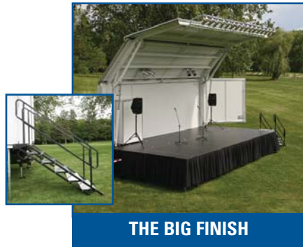
THE BIG FINISH

The stage is also deployed via the remote control. Dual hydraulic cylinders lower it quickly. You can then adjust the five stage legs to accommodate uneven or sloping ground to maintain a level stage.